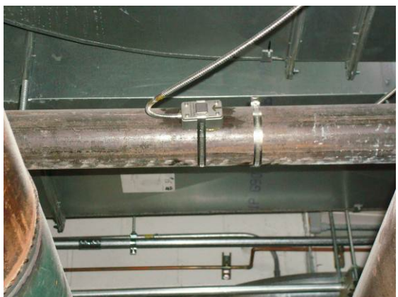
Dumped Heat Flowrate (FM-5)