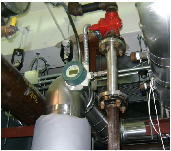
Sage Gas Meter on Engine 1