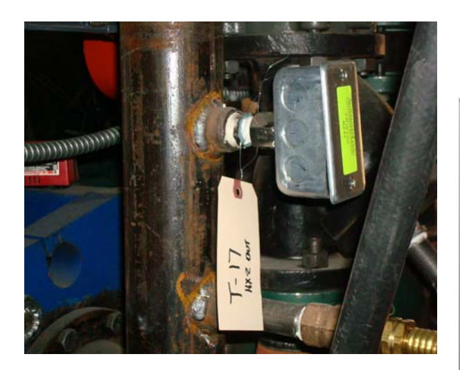
Recovered heat loop temperature sensor (TYP)