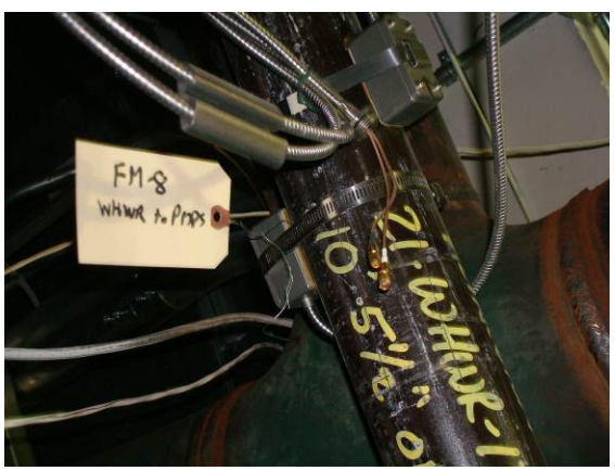
Heat Recovery Loop Flowrate (FM-8)