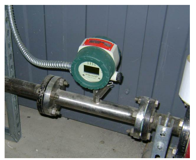
Cogen unit gas meter (TYP).