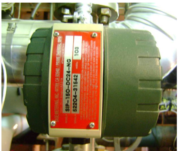
Gas Meter Nameplate Figure 5. Gas Meter Locations and Information