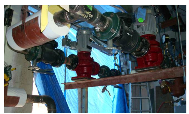
Main Loop Pumps