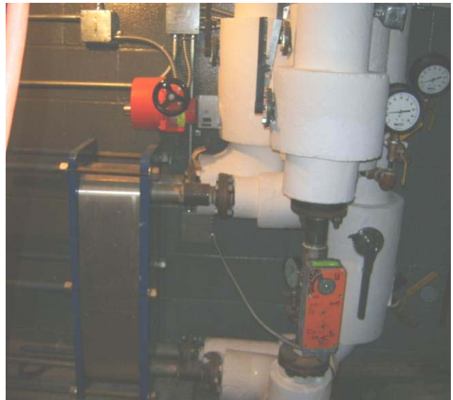
HX#1 - Space Heating Loads