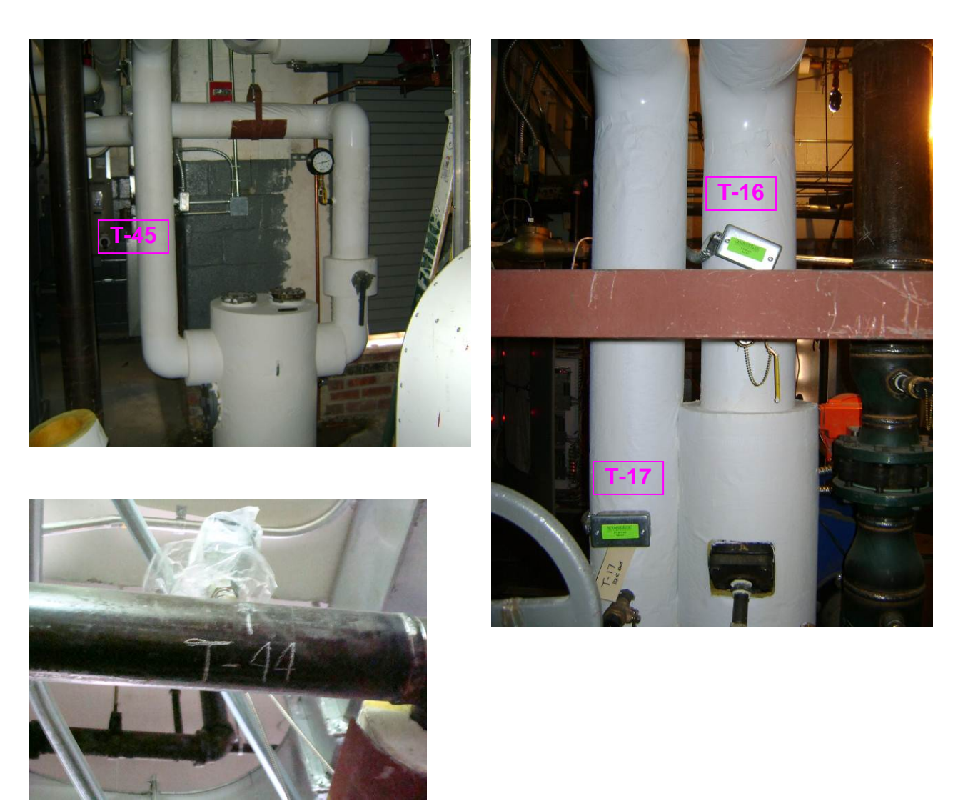
HR Return Temp (T-44) Back to Engines

Figure 3. Locations of Temperature Sensors