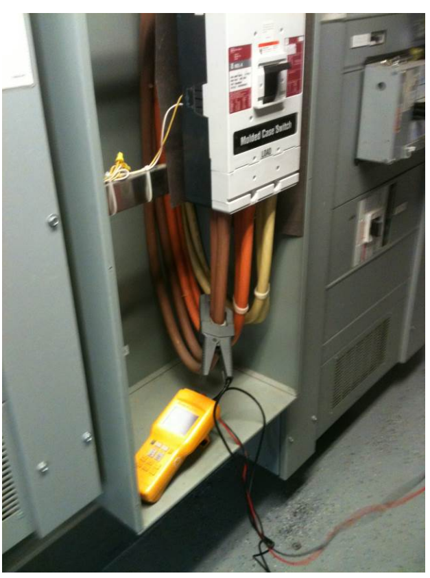
CGDP-2, 800 A cogen disconnect panel. Location of power verification and Veris power meter future location.