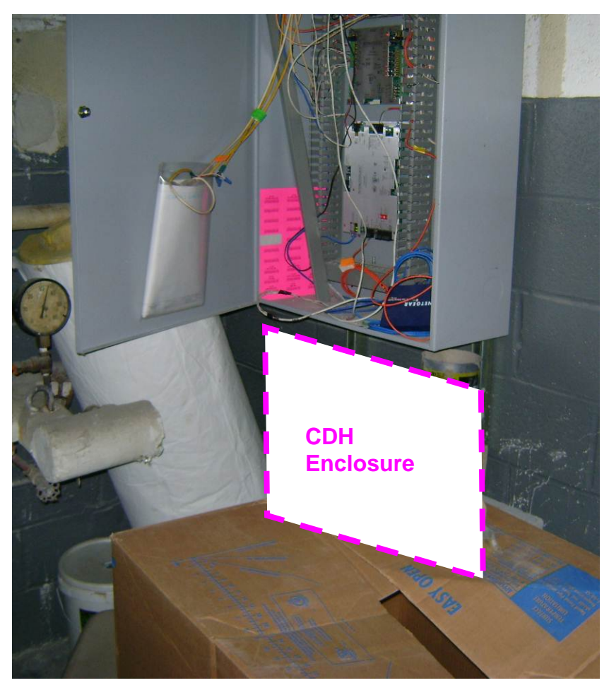
Figure 7. Location for CDH Panel

CDH will install an Obvius Acqusuite Datalogger with a UPS in its own enclosure underneath the current Auotmated Logic (ALC) panel (see below). The datalogger will communicate with the ALC controller via MODBUS RTU to the extract readings (in Table 1) from the control system. CDH will use the 120 Volt power inside the ALC panel to power the datalogger. Endurant/The Princeton Club will provide internet access to the datalogger by providing a fixed IP-address (accessible from the internet) with a port forwarded to the datalogger's local IP address. The DSL line will be shared with the Broad Chiller.