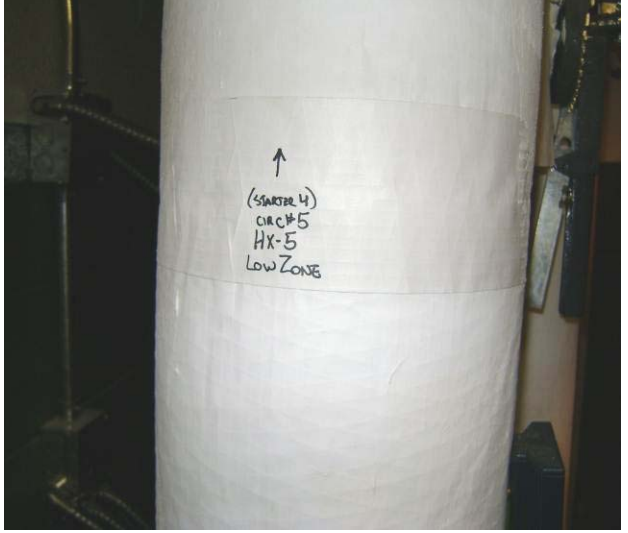
HX#5 - Plumbing Low Zone