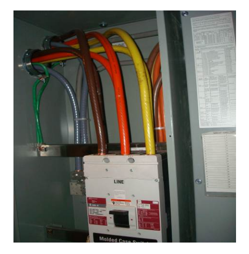
Suggested Location for Power Transducer for Engine Power ( WG , 3 engines combined)

10<sup>th</sup> Floor Engine Power Panel